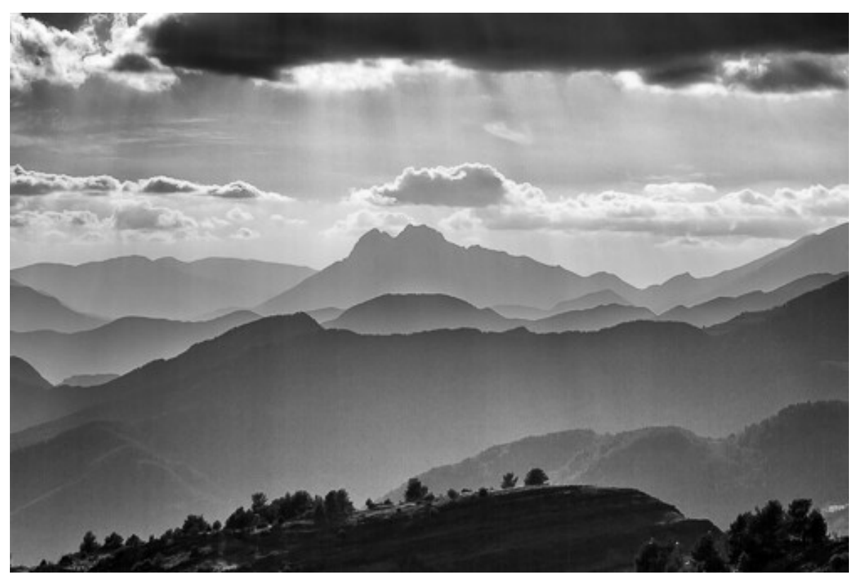
"Fairyland" digital image, various sizes

I grew up around photography, but my photographic journey did not begin until I fell sick with a life-threatening disease. Once my doctors saved me, I started receiving help for the mental illness caused by having a physical ailment at such a formative age. This is where photography assisted and still assists.