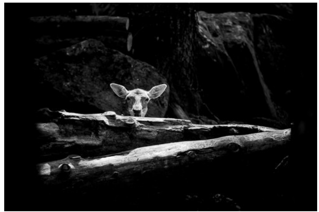
"Believe" digital image, various sizes

After a solo trip to Austria, I decided to undertake some training to hone my skills. Since then, I have completed commercial projects as well as personal work. However, it's the personal work that I intend to discuss. Photography has encouraged me to show my creative side, exploring my thoughts with growing confidence and finding other ways to express myself through different artistic mediums.