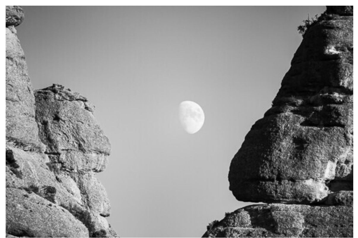
"The Sphinx and the Monkey" digital image, various sizes

I have tried many times to categorise my personal photos, but have never been fully satisfied. Recently, I decided to view them together as a group, referring to them as Shapes, Forms and Drama . The photos cover different genres such as landscape and nature. But what they have in common is all the images are black and white and lie somewhere between reality and a dream world with a whimsical, fantastical feel.