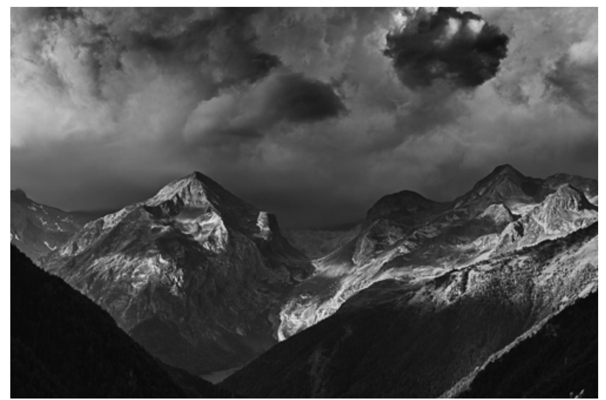
"Battle" digital image, various sizes

I grew up around photography, but my photographic journey did not begin until I fell sick with a life-threatening disease. Once my doctors saved me, I started receiving help for the mental illness caused by having a physical ailment at such a formative age. This is where photography assisted and still assists.