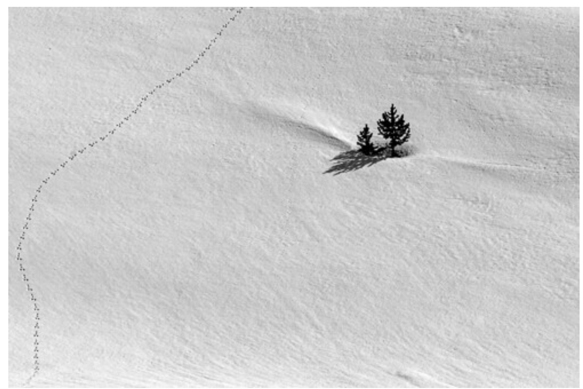
"So lonely" digital image, various sizes

They are an attempt to give an insight into what I see when photographing, glimpses of how I allow my mental state to control what I shoot, showing the beauty of the subject.Many of my images involve mountains or locations where I can allow my mind to wander.