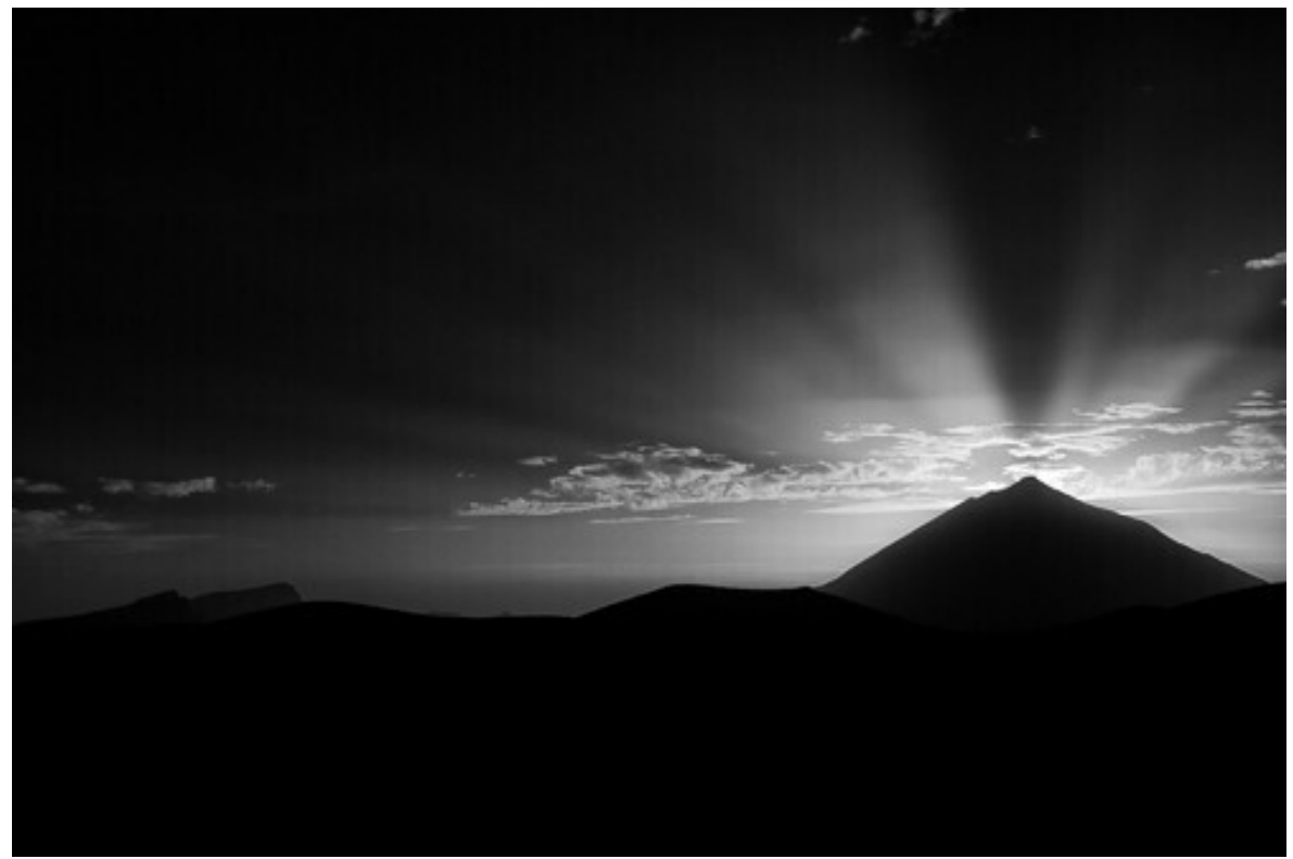
"Light" digital image, various sizes

After a solo trip to Austria, I decided to undertake some training to hone my skills. Since then, I have completed commercial projects as well as personal work. However, it's the personal work that I intend to discuss. Photography has encouraged me to show my creative side, exploring my thoughts with growing confidence and finding other ways to express myself through different artistic mediums.