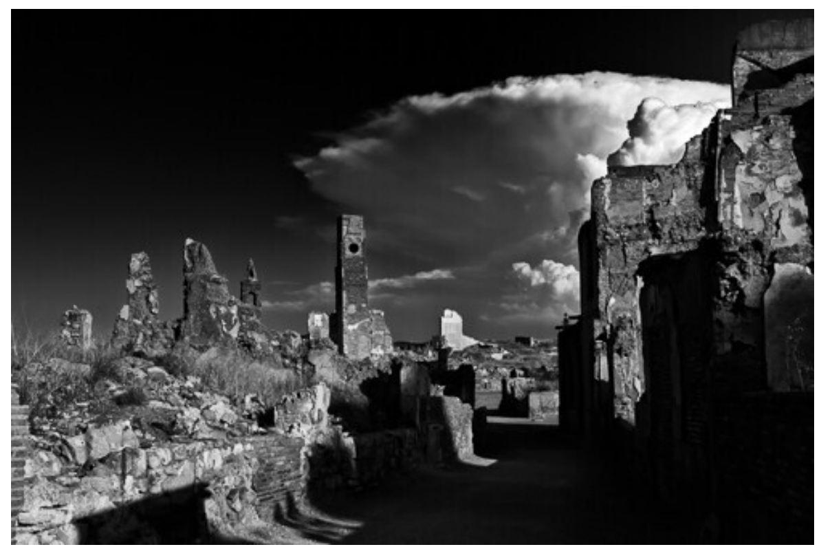
"Despair – Remains of war" digital image, various sizes

I have tried many times to categorise my personal photos, but have never been fully satisfied. Recently, I decided to view them together as a group, referring to them as Shapes, Forms and Drama . The photos cover different genres such as landscape and nature. But what they have in common is all the images are black and white and lie somewhere between reality and a dream world with a whimsical, fantastical feel.