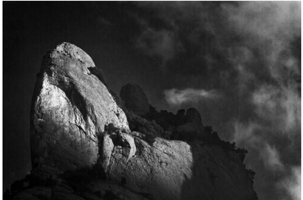
"Into the light" digital image, various sizes

I often daydream, inventing stories related to my surroundings. Vegetation, light, and rock textures combine to create magical figures, sometimes monstrous, other times not; but what makes me set the camera and press the shutter button is something more.It's an emotional, mental pinnacle that I reach from observing an area over a period. It could be minutes, hours or involve numerous visits to a location.