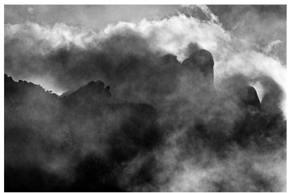
"Hidden" digital image, various sizes

They are an attempt to give an insight into what I see when photographing, glimpses of how I allow my mental state to control what I shoot, showing the beauty of the subject.Many of my images involve mountains or locations where I can allow my mind to wander.